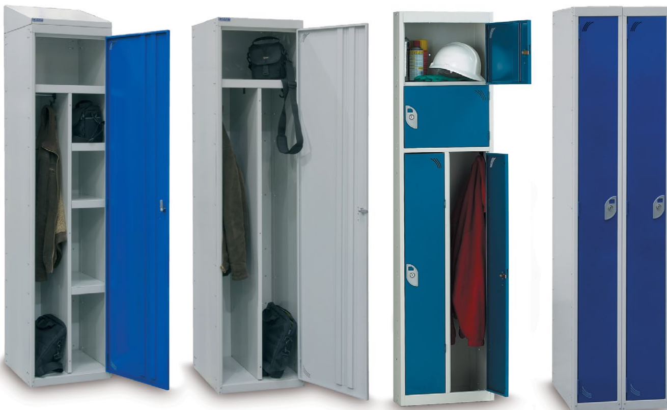
Staff Locker (Shown with sloping top please refer to page 81)