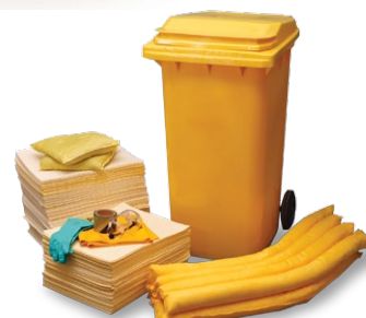
U-360-WB - 360L Chemical