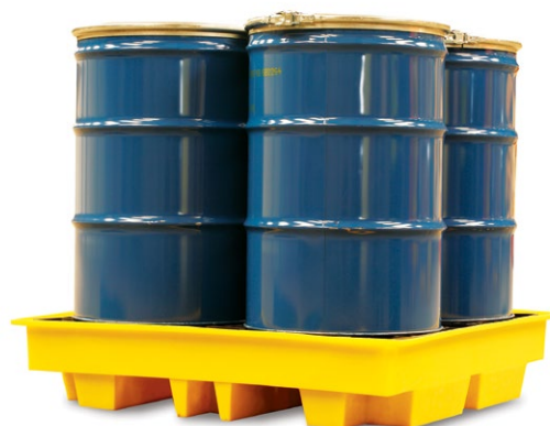
FSC4DSP 4 Drum Poly Sump Pallet