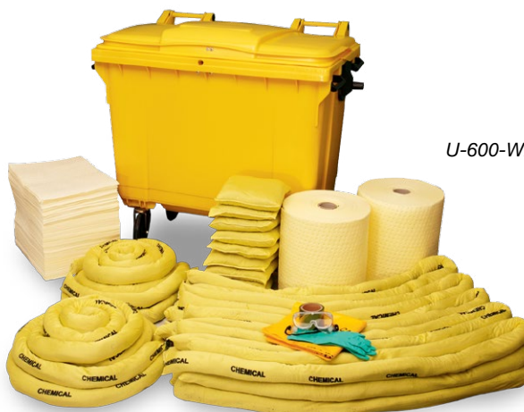
U-600-WL - 600L Chemical