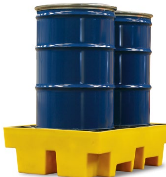
FSC2DSP 2 Drum Poly Sump Pallet