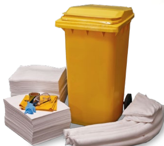
O-240-WB - 240L Oil Only