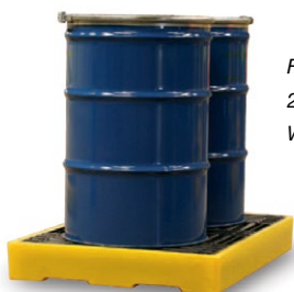
FSC2DWF 2 Drum Poly Workfloor