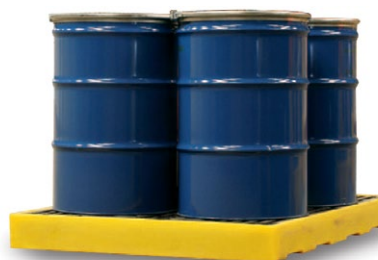
FSC4DWF 4 Drum Poly Workfloor