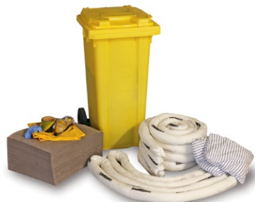
M-120-WB - 120L Maintenance