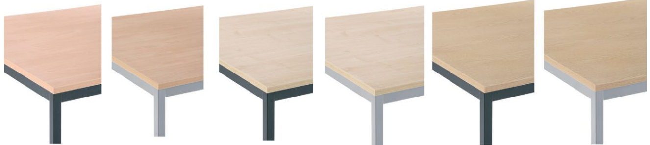
Beech &amp; Black