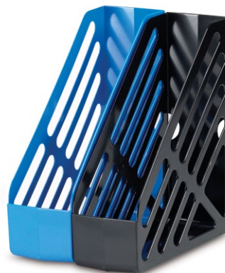
036YT/BLU/24 + 036YT/BLK/24