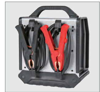
neat rear clamp & cable storage hooks