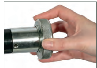
Knurled pressure release valve