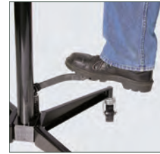
Oversized foot pedal for easy lifting