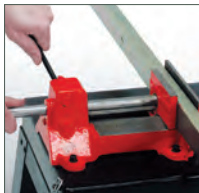
Sliding vice included