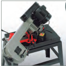
Swivel arm mitre 0° to 45°

The 6" metal cutting bandsaw is powered by a 550w (1hp) induction motor and is ideally suited for general workshop use.