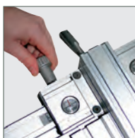
Micro fence adjustment