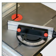
Heavy duty cast iron mitre fence