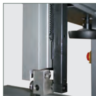
Rack & pinion rise and fall