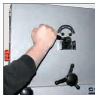
Quick release blade tension