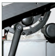
Rack and pinion 45° table tilt