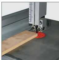
Auxiliary Fence for cutting thinner materials