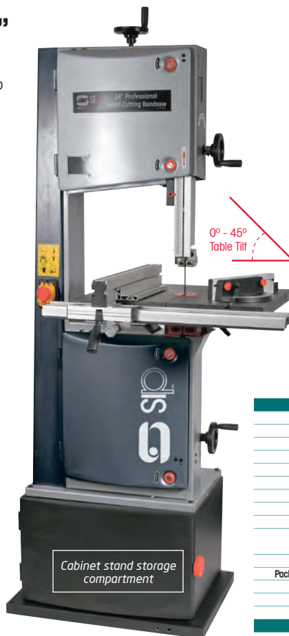
Cabinet stand storage compartment