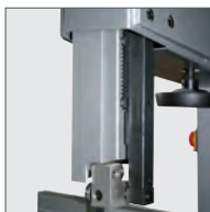
Rack & pinion rise and fall