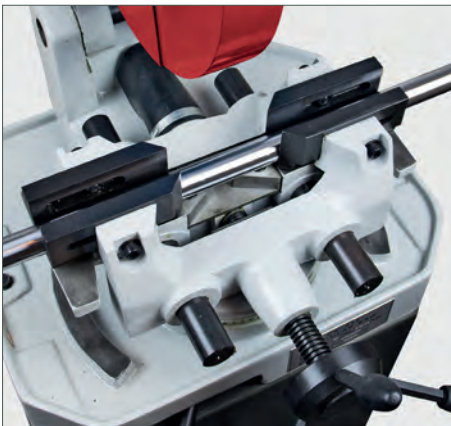
Twin vice - centralises the workpiece