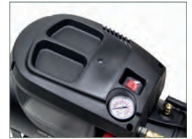
Useful integrated tool tray