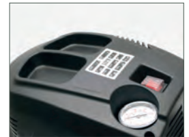
Useful integrated tool tray