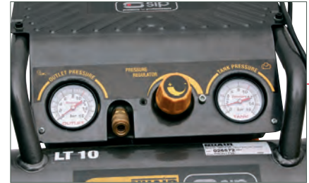
Unique, integrated pressure control panel