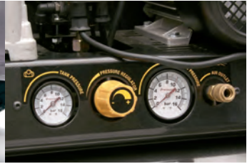
Large adjustment knob & large easy to read dials