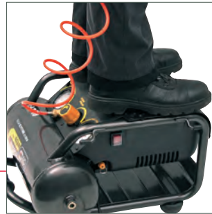
Integrated foot plate - extra height when required