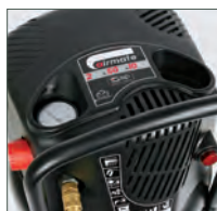
top mounted control panel - 06243