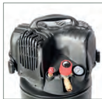
top mounted control panel - 06249