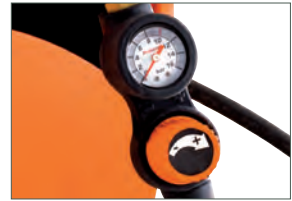
Built-in remote pressure regulator on hose for added convenience