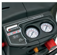
top mounted control panel - 06245