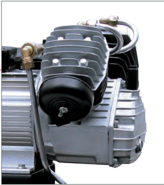
Super smooth 'V-Twin' aluminium pump