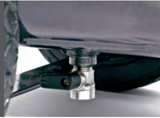
Professional bleed-tap with enlarged passage to avoid blockages