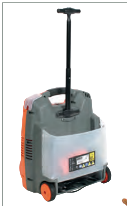
Pull-out handle and integrated storage compartment

inflating gun, 3 needles (for inflating balls, bicycle tyres or small inflatable mattresses, inflator gun with gauge and 3 metre recoil air hose.