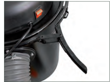
Quick action clamp for easy lid removal