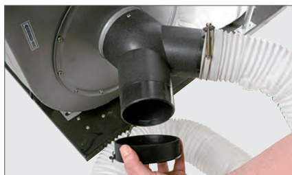
Twin dust input facility - gives the option of running two machines with one extractor