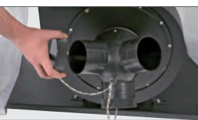
Triple dust input facility - gives the option of running three machines with one extractor