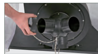
Triple dust input facility - gives the option of running three machines with one extractor