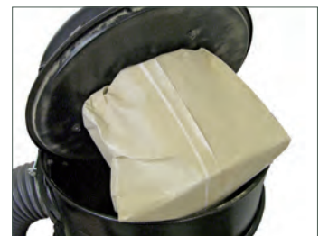
Filter bag for clean, quick emptying