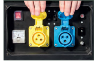
1x 230v, 1x 110v AC (16amp) Output Sockets