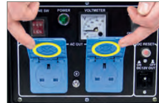
2x 230v (AC), 1x 12v DC Output Sockets