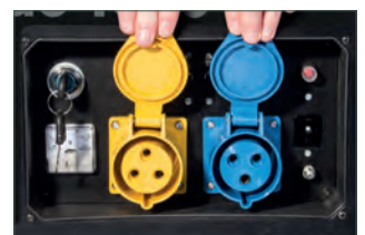
1x 230v (AC), 1x 110v (AC), 1x 12v DC Output Sockets