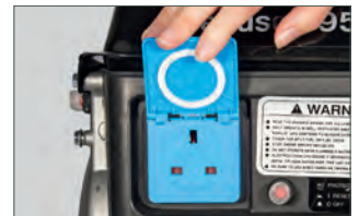
1x 230v 3pin (UK), 1x 12v DC Output Sockets