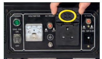
1x 230v 3pin (UK), 1x 12v DC Output Sockets