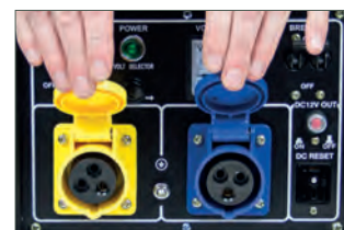
1x 230v (AC), 1x 110v (AC), 1x 12v DC Output Sockets