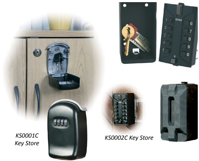
KS0001C Key Store