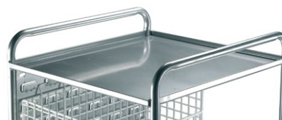
CST Shelf/Tray Tray size: W500 x D455mm

Supplied complete with a TP1 louvred panel. See pages 8 and 9 for full details.