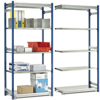
023410SI + 023410SE Initial Single Bay and Extension Single Bay