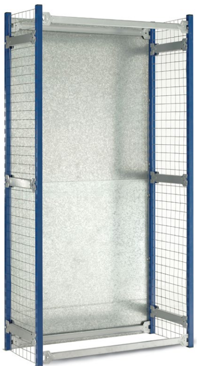
Cladding – Mesh Sides / Steel Rear