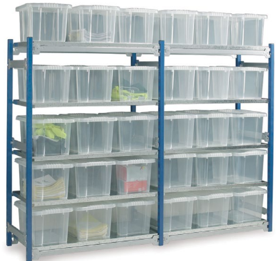
023355SIPC + 023355SEPC

Max shelf capacities: (UDL) 870 x 290 = 160kg each | 970 x 290 = 150kg each 870 x 440 = 160kg each | 970 x 440 = 150kg each