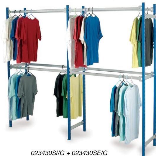
023430SI/G + 023430SE/G