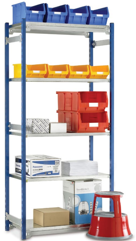
Standard Single Bay

Uprights are finished epoxy powder coated blue, beams and ties are epoxy powder coated silver/grey and shelves are galvanised as standard (other colours are available upon request, refer to choice on page 49).