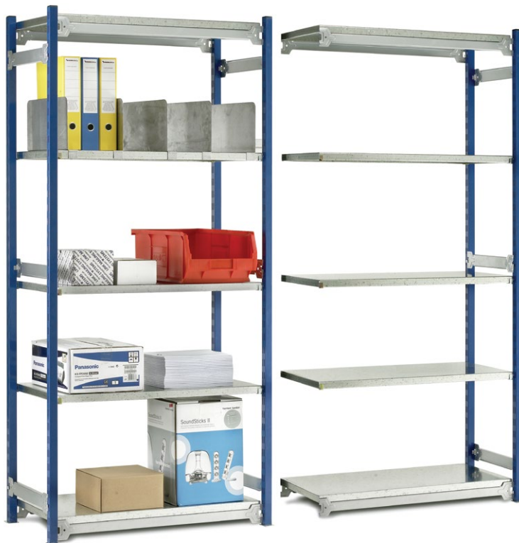
Standard Single Bay + Extension Bay