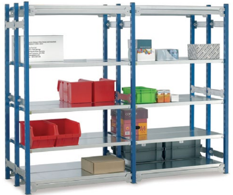
022410DI + 022410DE