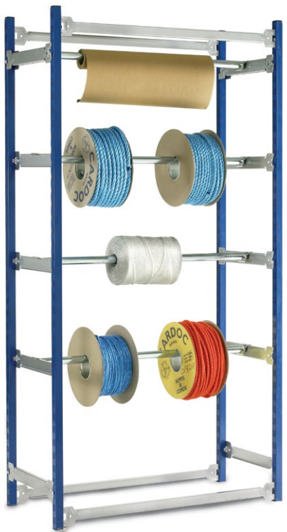
Cable Reel Dispensing

Toprax also offers the option for rear and side cladding. Available in either a 50 x 50mm mesh grid or galvanised steel sheet, for effective segregation of bays.