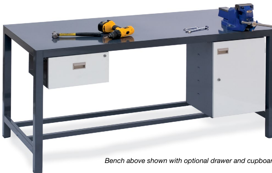
Bench above shown with optional drawer and cupboard.

Heavy duty bench suitable for heavy duty applications such as engineering and manufacturing.