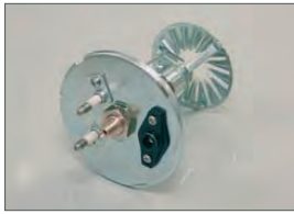
Electrode - Fuel Nozzles Snap on deflector allows immediate access to fuel nozzles & electrodes