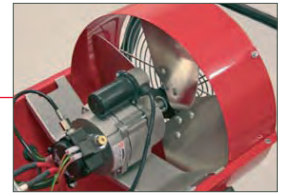
Fan - Danfloss Fuel Pump To enhance performance of the fan a shroud unit has been added to provide a ducted fan.