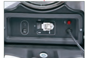
Control Panel Tough flame proof plastic, built into fuel tank to ensure no infiltration of water, dust, etc...