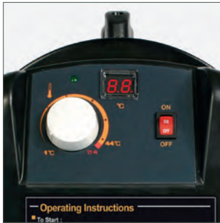
LED temperature display panel