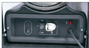
Automatic control panel for ease of use