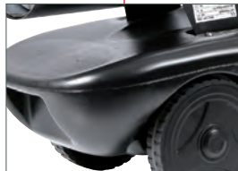
Fuel Tank Tough hydrocarbon resistant polythene construction containing special additives for use in particularly cold environments