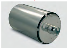
Combustion Chamber Manufactured from AISI 430 stainless steel with aluminised steel heat exchangers for better cooling