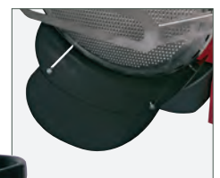
Integrated heat deflector, protects flooring