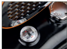
Easy to read fuel gauge. (on items: 09562, 09564, 09566, 09568 and 09570)