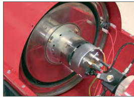
Burner Designed to ensure a perfect air-fuel mixture, resulting in an almost total combustion, with a CO 2 level of Oppm