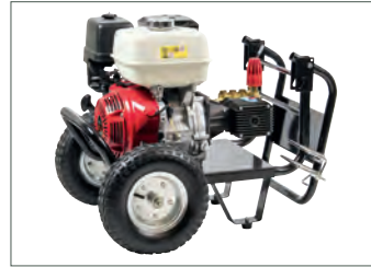
SIP folding frame design - for easy storage