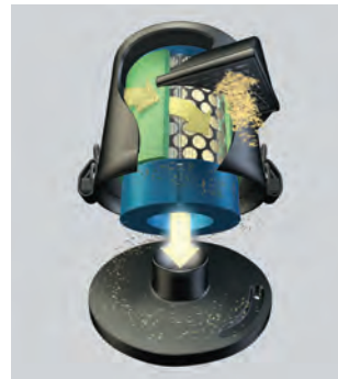
Quad Clean™ Cyclonic air cleaner