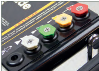
Frame mounted nozzle storage