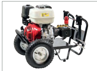
SIP Folding Frame design - for easy storage