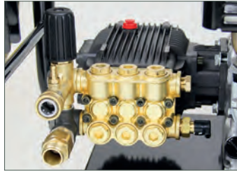
Brass head pump