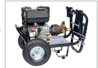
folding frame, saves space when unit is stored