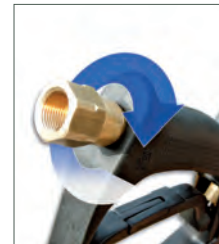
Swivel connection lance