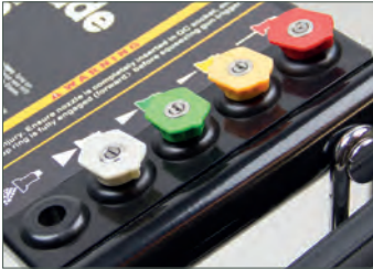
Frame mounted nozzle storage