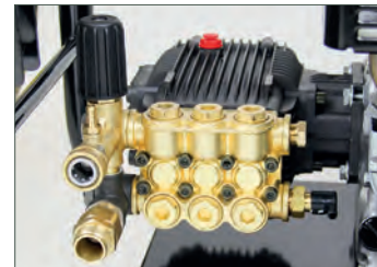
Brass head pump