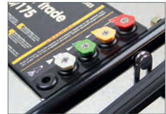
Full nozzle selection, situated on convenient frame mounted dispenser