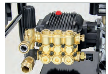
Brass head pump