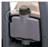
internal detergent tank